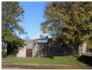
Christ The Servant Church Birkrig, Skelmersdale Lancashire WN8 9HW