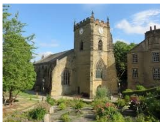
St Thomas the Martyr Church Church Street, Up Holland, Skelmersdale, Lancashire WN8 0ND